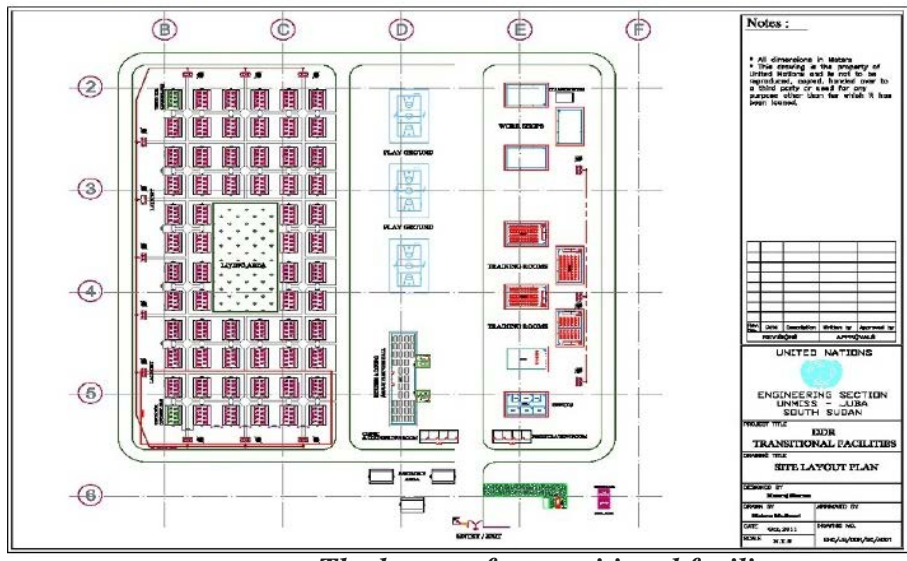
The layout of a transitional facility