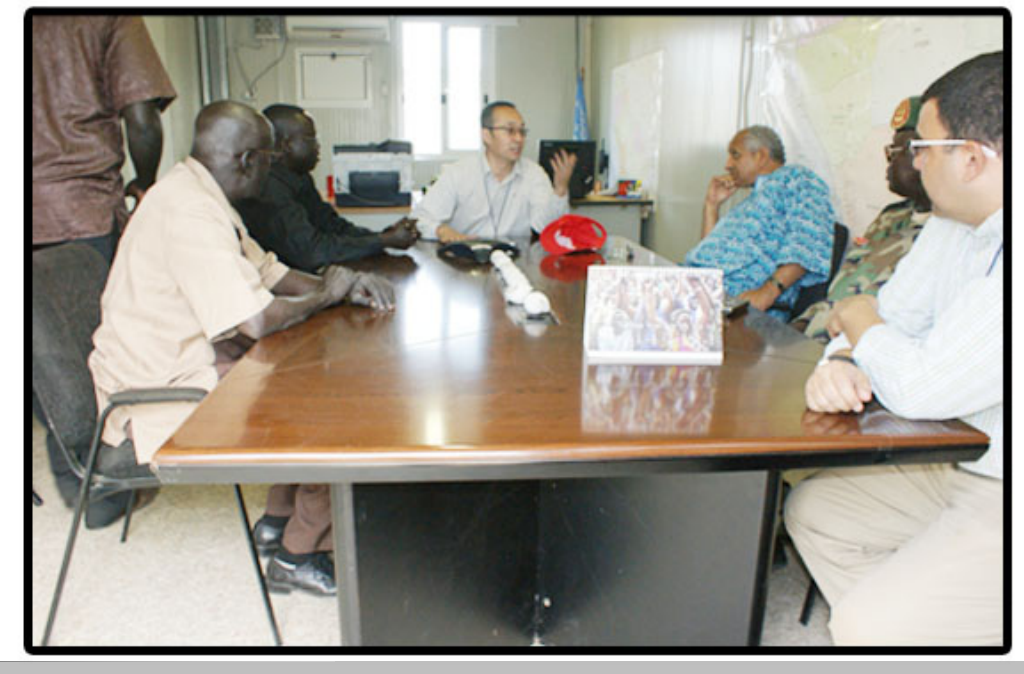
DDR Team on a mission to assess transitional facility at Pariak, Jonglei State