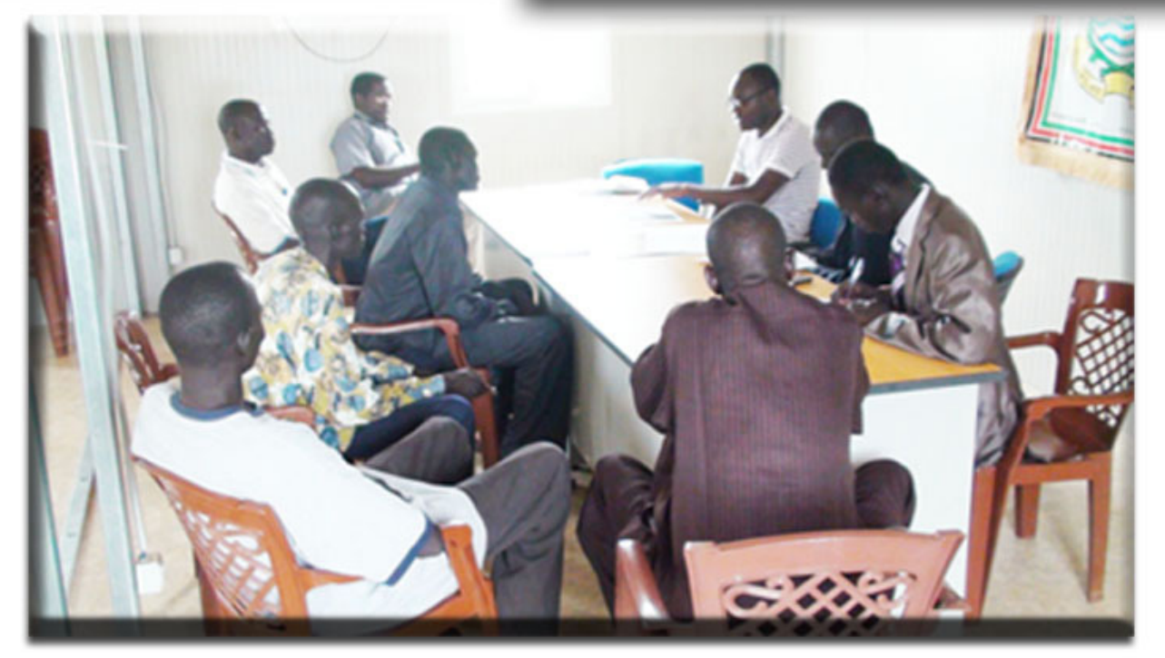
PI Consultative Visit to Greater Bhar El Ghazal to incorporate views on PI national strategy; share annual work plan and conduct states profiling