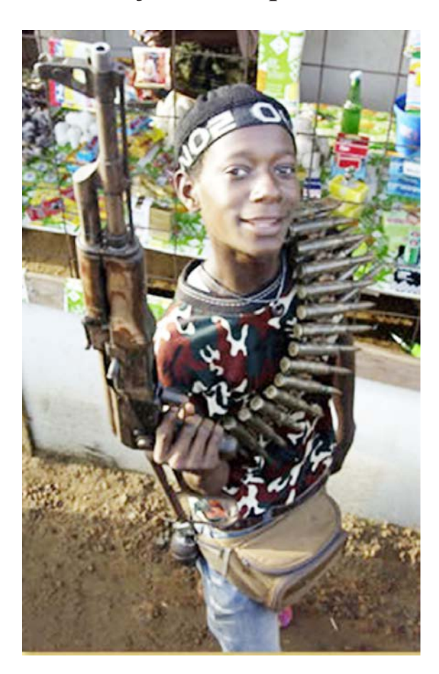
By Ernest Harsch

UN conference to promote reintegration of ex-fighters in Africa