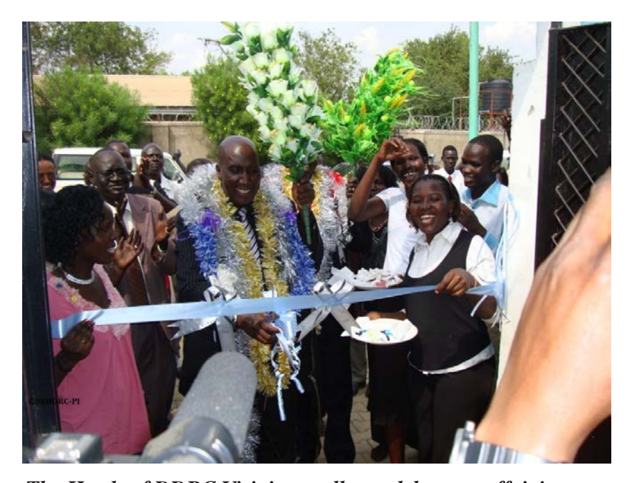
The Heads of DDRC Visit is usually a celebratory affair!

V. Post Independence DDR Pilot Project for 4,500 ex-combatants starts in April, 2012