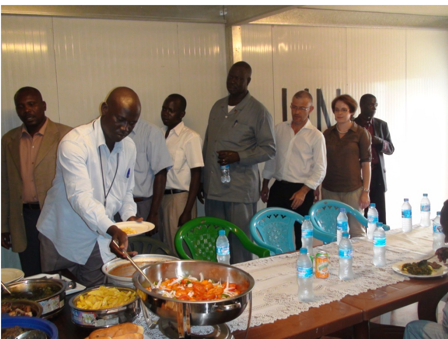
Official opening of the Central Equatoria State DDR offices in Juba